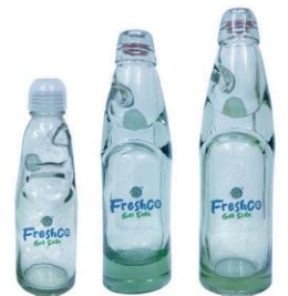
180 ML | 180 ML | 270 ML