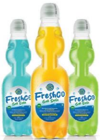
PLASTIC BOTTLE RS. 20&30