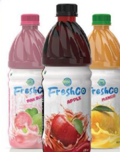
JUICES RS. 10