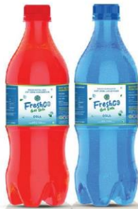
ENERGY DRINKS RS. 10 & 20