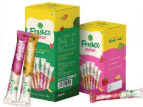
ICEPOP (RS.5 & 10)